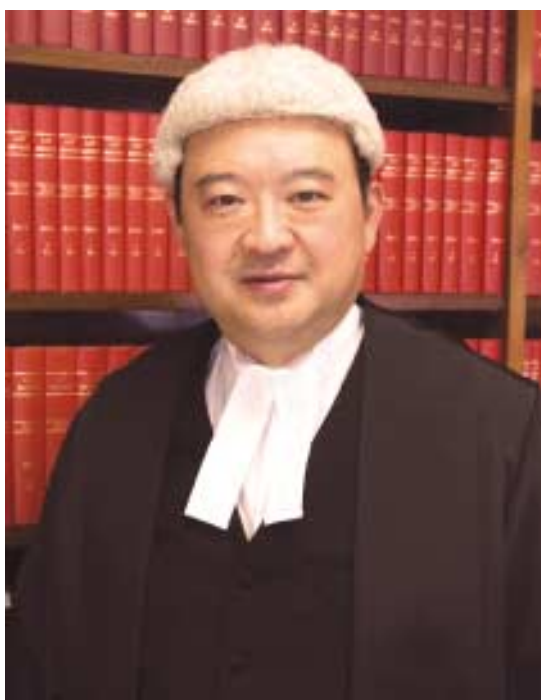
高等法院首席法官馬道立 The Hon Mr Justice Ma, the Chief Judge of the High Court