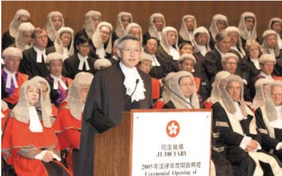
終審法院首席法官於 2005 法律年度開啟典禮上致辭 The Chief Justice delivers a speech at the Ceremonial Opening of the Legal Year 2005