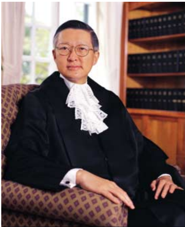
終審法院首席法官李國能 The Hon Chief Justice Andrew Kwok-nang Li