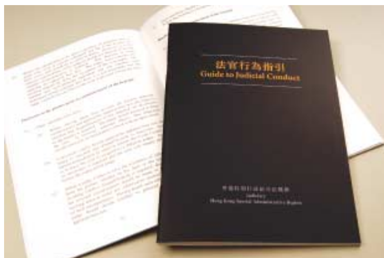
《法官行為指引》 Guide to Judicial Conduct

The Chief Justice considers that it is of fundamental importance that judges and judicial officers must at all times observe the highest standards of conduct and integrity. This is essential for the maintenance of public confidence in the Judiciary and the administration of justice. Published in October 2004, the purpose of the Guide to Judicial Conduct is to provide practical assistance to judges in dealing with matters relating to judicial conduct. The Chief Justice is confident that it will serve that purpose. The Guide is accessible to the public on the Judiciary's Website ( http://www.judiciary.gov.hk ).