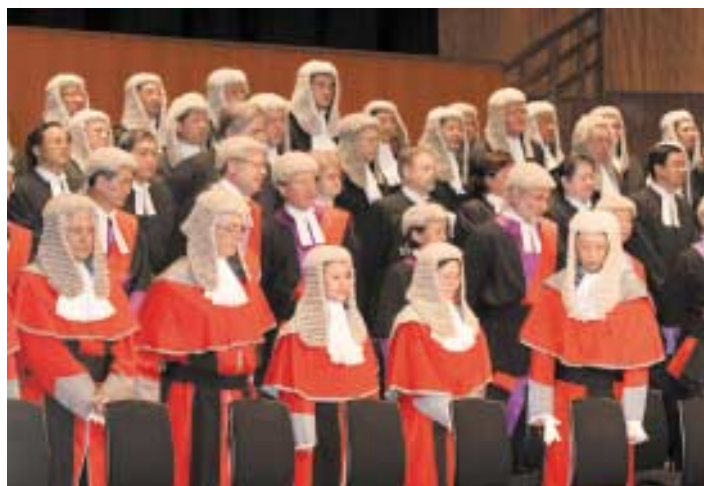
法官及司法人員和法律界人士出席 2005 法律年度開啟典禮