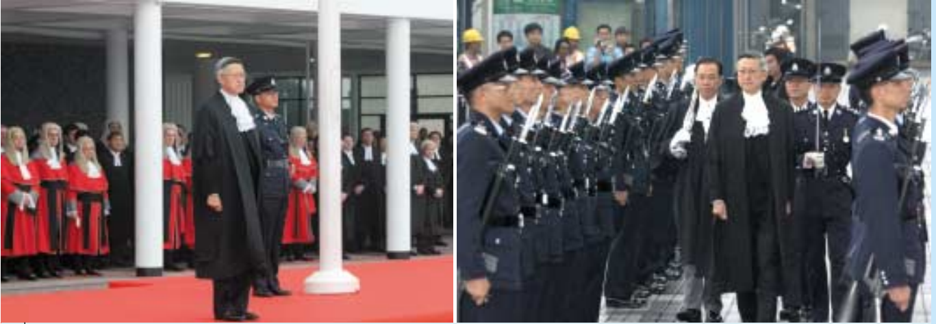
終審法院首席法官主持 2005 法律年度開啟典禮（左圖）及檢閱儀仗隊（右圖） The Chief Justice officiates at the Ceremonial Opening of the Legal Year 2005 (left photo) and inspects the Guard of Honour (right photo)