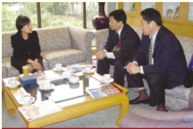
高等法院原訟法庭法官朱芬齡（左）與南京市司法局訪港團會面 The Hon Madam Justice Chu, Judge of the Court of First Instance of the High Court (left) and a delegation of Nanjing Justice Bureau