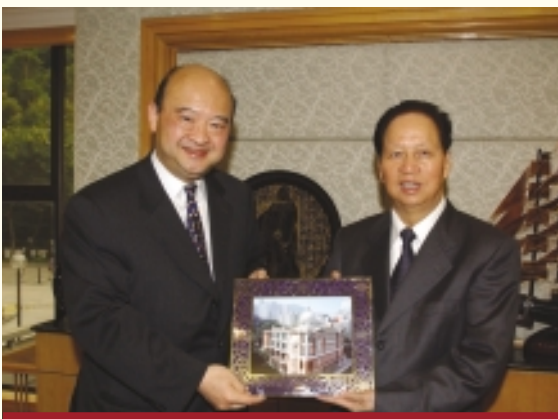
高等法院首席法官馬道立（左）與最高人民法院院長蕭揚首席大法官會面（右） The Hon Mr Justice Ma, the Chief Judge of the High Court (left) and the Chief Justice Mr Xiao Yang, President of the Supreme People's Court (right)