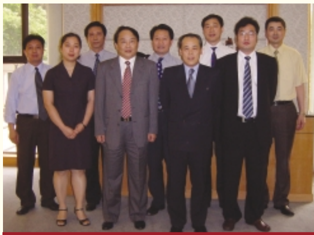
高等法院上訴法庭法官楊振權(前排右二)與重慶市高級人民法院考察團會面

The High Court Registry accepts the lodging of all civil claims without limits to the amount claimed except where certain types of claims are required by statute to be initiated in other courts or tribunals. It provides registry services for filing originating and other court documents. It maintains records of civil cases, fixes hearing dates for all proceedings before Masters unless otherwise directed, and processes applications for issuance of writs for enforcement of judgments and orders. As from 19 April 2004, the High Court Registry took over the functions of the Oaths and Declarations Office, which administers oaths and declarations for documents relating to court proceedings, and is also responsible for the appointment of Commissioners for Oaths from government bureaux and departments.