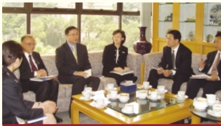
高等法院原訟法庭法官湯寶臣（左三）、高等法院司法常務官陳爵（左二）及終審法院司法常務官歐陽桂如女士（右三）與司法部的官員會面

For criminal appeals, the target waiting time can be met. For civil appeals, the target waiting time cannot be met as more complex and lengthy cases were set down for hearing.