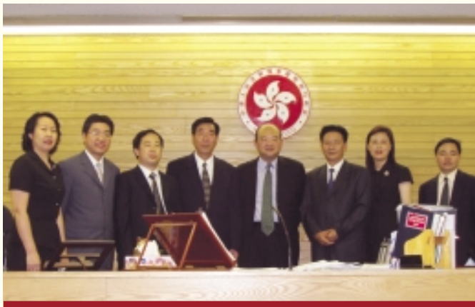
高等法院首席法官與福建省高級人民法院代表團會面 The Chief Judge of the High Court meets with a delegation from the People's High Court of Fujian Province

除此之外，高等法院司法常務官還負責管理高等法院訴訟人儲存金和勞資審裁處訴訟人儲存金，又以當然遺產管理官和精神病患者財產賬目聆案官的身分，管理遺產管理官賬目和精神病患者財產賬目。高等法院司法常務官亦負責備存大律師、律師和公證人的專業名冊。