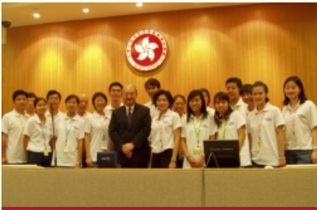
高等法院首席法官與龍滙100華人青年領袖論壇2004的代表會面 The Chief Judge of the High Court meets with delegates of the Dragon 100 Young Chinese Leaders Forum 2004

有關方面最初擬透過立法途徑來實施工作小組的建議，但是司法機構其後指出應考慮通過實務指示以更有效實施有關建議。司法機構將會就此諮詢兩個法律專業團體，並會考慮他們的意見以擬定未來路向。