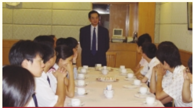
高等法院原訟法庭法官任懿君向清華大學學生介紹香港的司法制度 The Hon Mr Justice Yam, Judge of the Court of First Instance of the High Court, briefs a group of students from Qinghua University on Hong Kong's judicial system.

The Probate Registry receives and processes applications for grants of representation to estates of deceased persons. Where the value of the estate exceeds $150,000 or the application may involve complicated legal issues, the application is usually filed by the legal representatives of the applicant. Where the value does not exceed $150,000 and is simple and straightforward, the Registry will assist the applicant in filing the necessary documents (or affidavits) for a grant of representation or for summary administration by the Official Administrator. The Registrar acted as the Official Administrator for 1 605 cases for the first nine months of 2004. The Probate Registry issued 7 273 grants of probate and letters of Administration during the period.