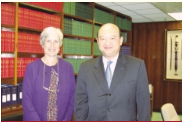
高等法院首席法官與美國路易斯安那州新奧爾良市東區 區域法院首席法官 Helen Ginger Berrigan 法官會面 The Chief Judge of the High Court and Judge Helen Ginger Berrigan, Chief Judge of the US District Court, Eastern District of Louisiana, New Orleans, the United States

陪審員制度是香港司法體系的一個重要部分。《陪審員條例》(第3章)詳列了擔任陪審員須具備的資格，對於有資格成為陪審員的香港市民而言，擔當這個角色既是權利，亦是義務。一般來說，任何香港居民，年齡介乎21至65歲，能夠充分掌握審訊程序所使用的法定語文的(不論中文或英文)，都會被列入陪審員候選名單內。名單內的人士有可能被傳召出席陪審員的選任程序及可能獲選中。如未被選中，有關人士可獲豁免擔任陪審員兩年。被傳召的公眾人士可在出席陪審員選任的前一天致電司法機構的查詢熱線或從司法機構的網頁上查詢被傳召當天會否進行陪審員選任，以便確定該日是否需要出席。根據現行的做法，被傳召的公眾人士只須到庭出席選任一次，如未被選中，則往後兩年便可獲豁免擔任陪審員。2004年1月1日至2004年9月30日期間，共有4 281名市民到庭出席選任程序，而有陪審員參與的審訊則有62宗。