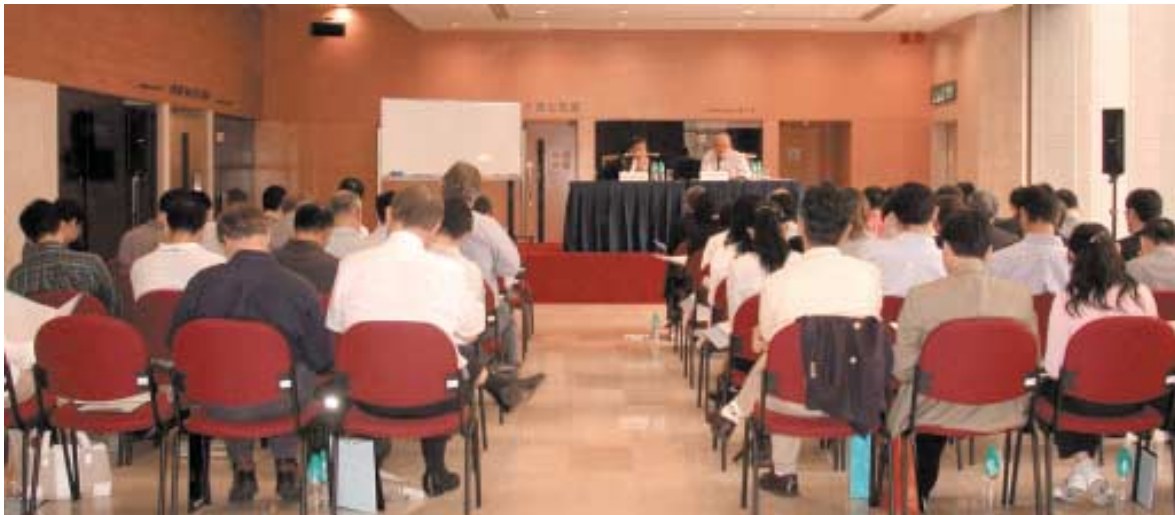
區域法院民事案件講座 District Court Seminar on Civil Matters

此外，我們亦在2005年12月舉行裁判官會議，討論「勞資傳票的量刑方針」、「永久擱置法律程序與司法覆核」及「自殺和防止自殺概況」等課題，共有50位法官和司法人員參加。