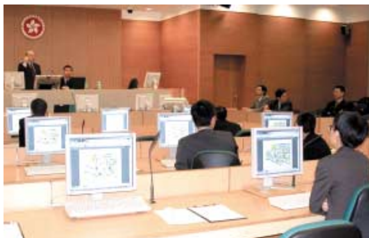
使用電子文件冊研討會 Seminar on use of electronic bundles

To help enrich JJOs' knowledge for coping with developments in the community, it is essential that the JSB offers training that caters for such a need. During the year, the Board organised seminars on services for victims and batterers of domestic violence, anti-drug policies and drug abuse problems in Hong Kong, use of electronic bundles and rehabilitation of sex offenders.