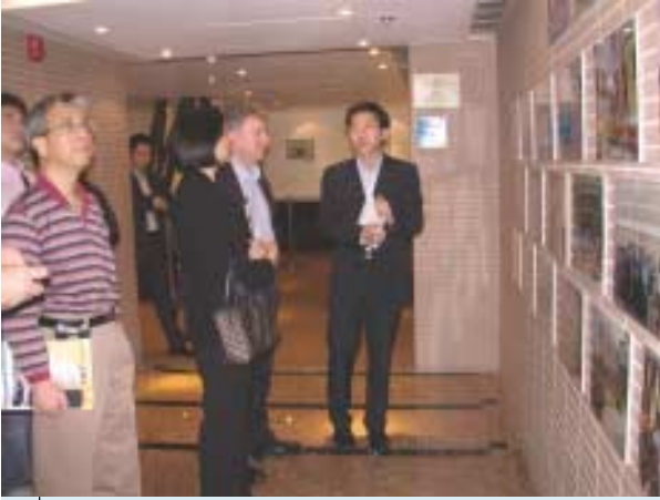
參觀懲教署的赤柱監獄 Visit to Stanley Prison of Correctional Services Department