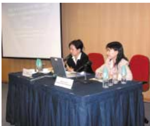
性犯罪者康復研討會 Seminar on rehabilitation of sex offenders