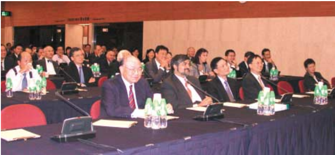
判決書撰寫課程 Judgment Writing Course

In September 2005, the Board launched its first tailor-made Judgment Writing Course for judges of the High Court and the District Court. This three-day course was modelled on a similar programme of the New Zealand Institute of Judicial Studies, and consisted of lectures, one-to-one tutorials and intensive small group sessions. Its aim was to improve the quality of the writing of English judgments by judges.