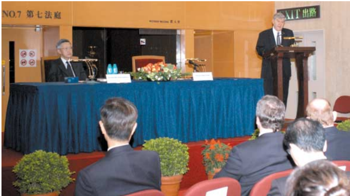
以色列最高法院院長巴哈龍·巴拉克主講「司法酌情決定權的性質」 The Honourable Aharon Barak, President of the Supreme Court of Israel, gives a talk on "The Nature of Judicial Discretion"

In April 2005, the Honourable Aharon Barak, President of the Supreme Court of Israel, gave a talk on "The Nature of Judicial Discretion" to our judges. Members of the legal profession, as well as the teaching staff and students of the law schools at the local universities also attended.