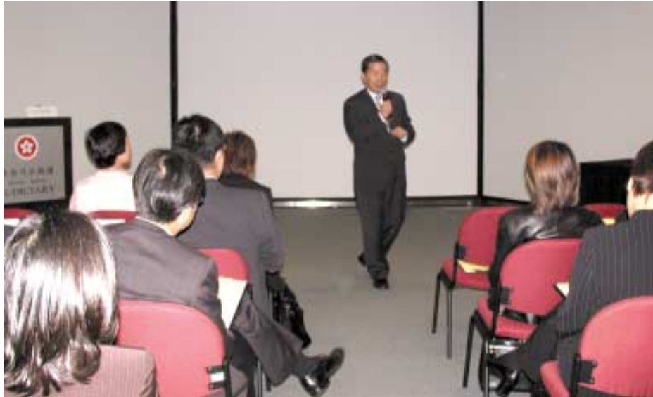
香港禁毒政策和濫用藥物問題研討會 Seminar on anti-drug policies and drug abuse problems in Hong Kong