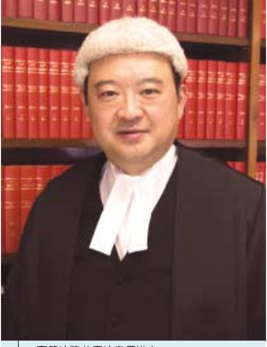
高等法院首席法官馬道立 The Hon Mr Justice Ma, the Chief Judge of the High Court