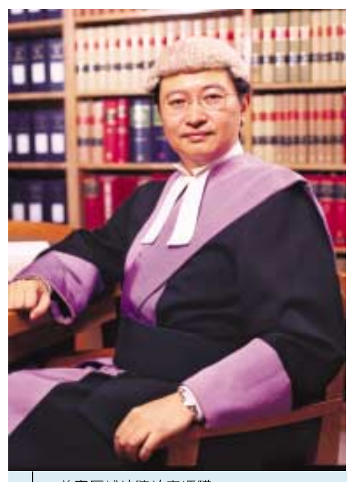
首席區域法院法官馮驊 HH Judge Fung, the Chief District Judge