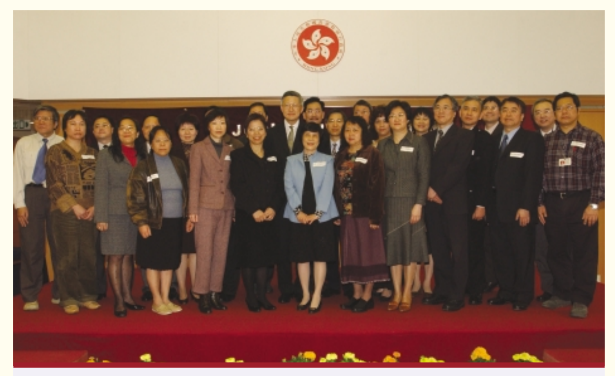
終審法院首席法官頒授長期及優良服務獎狀和退休紀念品予司法機構職員 The Chief Justice presents Long and Meritorious Service Awards and retirement souvenirs to staff of the Judiciary.