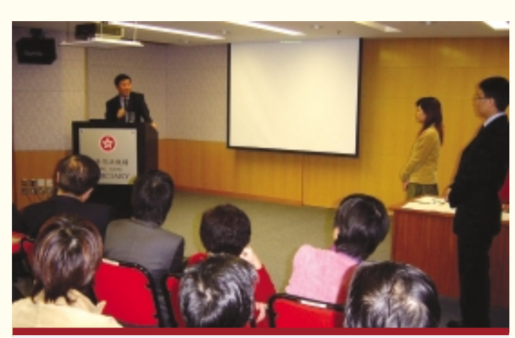
「面對危機」分享會 Workship on crisis management

To facilitate and implement changes as a result of the Second Voluntary Retirement Scheme and Business Process Re-engineering initiatives, two workshops on facilitation skills were organised in March and May 2004 to equip 48 supervisory staff with the necessary mindset and skill for change management. Workshops on Six Thinking Hats and Lateral Thinking were organised for 30 section heads and unit managers in March 2004. The former aimed to equip the participants with skills to examine issues from different angles, the latter illustrated how creative ideas could be generated and offered an effective tool for participants to apply them in problem-solving.