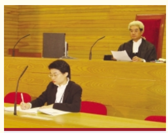
司法書記為法官在庭內提供支援服務 Judicial Clerk provides support services in court

notices, marshalling skeleton arguments, approving draft court orders, preparing criminal appeal bundles and proof-reading judgments.