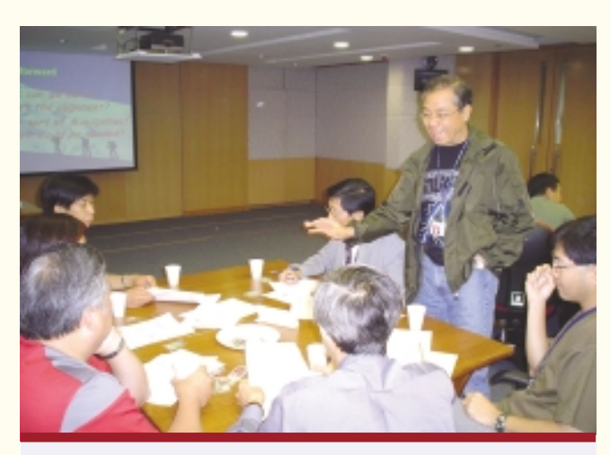
執達主任團隊建立工作坊 Team building workshop for Bailiffs

Enforcement of judgments and court orders, and service of court process are the responsibilities of the Court Orders Section. Currently, there are 51 Bailiffs and 43 Bailiff's Assistants. The concept of a docket system to streamline task assignment for Bailiffs, conceived by a Work Improvement Team (WIT) of Bailiffs, has effectively shortened the waiting time for executing court orders despite increases in caseload. The WIT has also developed and implemented initiatives in enhancing the operation manual, improving knowledge management and promoting good working relationship with the community, aiming at increasing the effectiveness of their services.