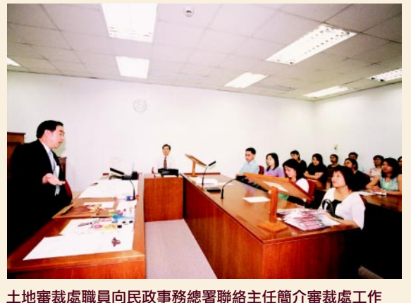
A Lands Tribunal officer briefs a group of Liaison Officers of Home Affairs Department on the work of the tribunal

An applicant takes oath before the Commissioner for Oaths at Lands Tribunal that she has served a copy of the application to the respondent