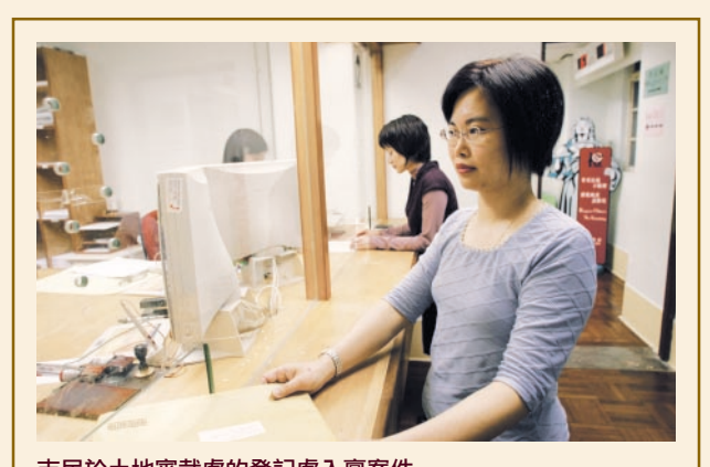
市民於土地審裁處的登記處入稟案件 Public file applications at the Lands Tribunal Registry

登記處電腦化完成後,不但方便了文件的 存檔、資料的提取和在線資料的共用, 而且有助更新排期資料,記錄費用和繳款 情況。電腦系統的使用提高了案件管理和 司法工作的水平。