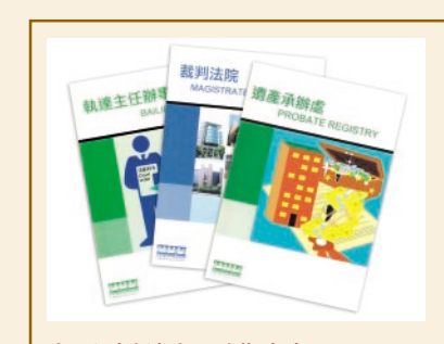
新系列的法庭服務指南小冊子 A new series of "Guide to Court Services" pamphlets

The Complaints Office also handles a large number of public enquiries in relation to protection of individual rights to access information on the Judiciary Administration.