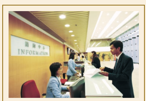
翻新後的杳詢櫃位 The information counter after renovation

高等法院查詢櫃位的 翻新工程最近完成。 新櫃位設計新穎、設 有展示案件審訊表的 等離子顯示器等先進 設施,還有更便利的 電話設施和更清晰的 指示標誌,給司法機 構帶來了具時代感的 新形象。查詢櫃位的