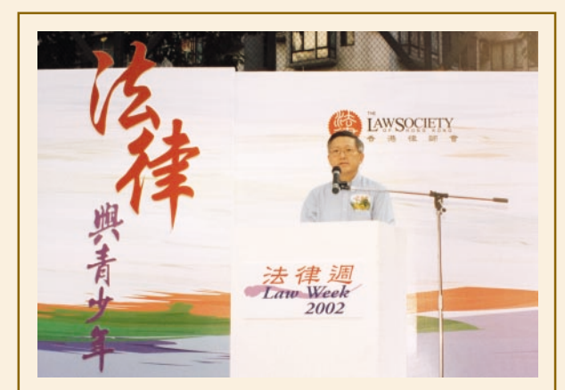
終審法院首席法官於2002年法律週開幕禮上致辭 The Chief Justice addresses the Opening Ceremony of Law Week 2002