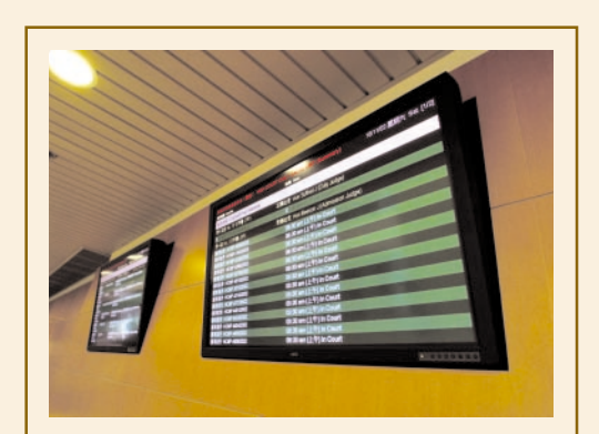
展示案件審訊表的等離子顯示器 Plasma monitors displaying court lists