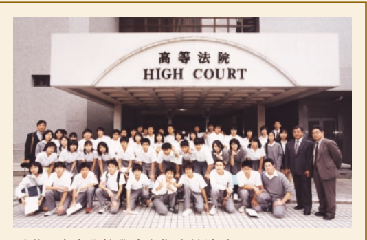
香港日本人學校學生參觀高等法院 Students from Hong Kong Japanese School visit High Court

To enhance the dissemination of information on court operations and services provided by the Judiciary, the current series of the "Guide to Court Services" pamphlets were re-written to include updated information and made more readerfriendly for reference by the general public.