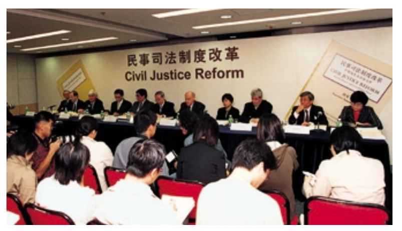
宣布諮詢工作展開 Announcement of the launching of the consultation exercise

10 | 香港司法機構 2001 年報 Hong Kong Judiciary Annual Report 2001