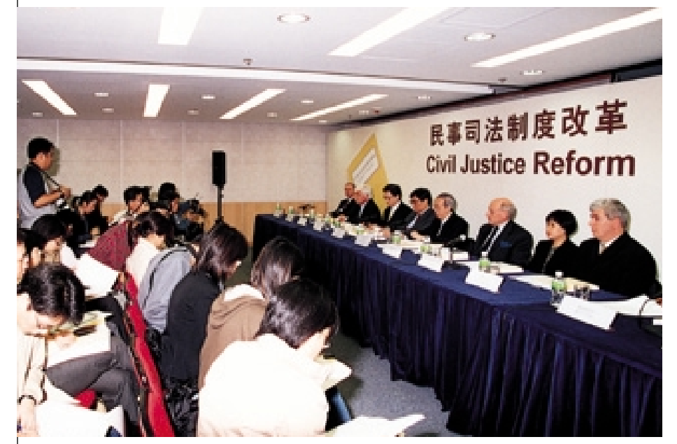
傳媒踴躍出席記者會 The launch of the consultation exercise draws good attention from the media

The Working Party decided to conduct a comprehensive consultation exercise to gauge views and feedback from the legal professionals, other interested parties and the community at large on the approach of and specific proposals on the civil justice reform. The Working Party will take into consideration all the comments and representations received before coming up with practicable recommendations to the Chief Justice.