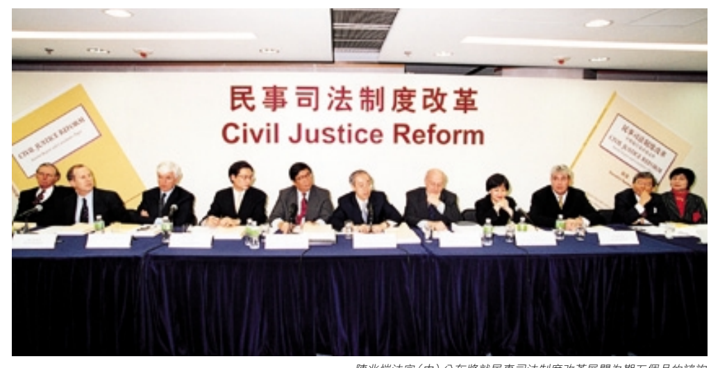
陳兆愷法官(中)公布將就民事司法制度改革展開為期五個月的諮詢 The Hon Mr Justice Partick Chan (centre) announces the launching of a 5-month long consultation exercise on civil justice reform

The CPR define the elements of active case management and expressly provide for the court's case management powers.