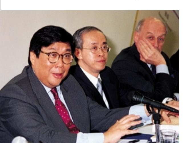
終審法院常任法官李義 (工作小組副主席) 解釋諮詢文件的建議 The Hon Mr Justice Ribeiro, Permanent Judge of the Court of Final Appeal and Deputy Chairman of the Working Party, details some of the recommendations