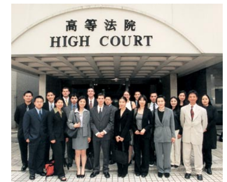
美國 Santa Clara Law Summer Program 参加者訪問高等法院 Participants of U.S. Santa Clara Law Summer Program visiting the High Court

To promote the understanding of the public on the court operation, the Press and Public Relations Office has arranged a total of 82 visits for local and overseas visitors (more than 6 000 in number) from January to November 2000. They include District Council Chairmen and members. In view of the keen interest expressed by primary schools, the visit programme was extended to primary school students this year.