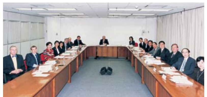
上訴法庭副庭長司徒冕法官(中) 主持刑事法庭使用者委員會會議 Criminal Court Users' Committee meeting chaired by The Hon Mr Justice Stuart-Moore, Vice-President of the Court of Appeal (middle)

In 2000, the Court Users' Committees held a total of seven meetings.