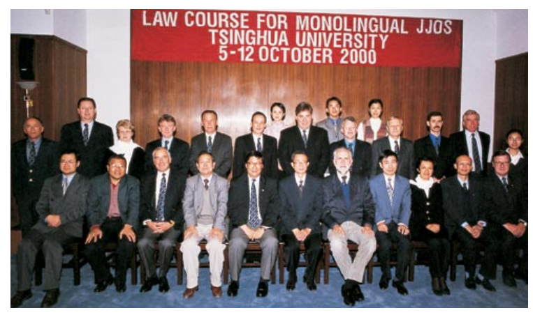
法官及司法人員修讀清華大學舉辦的法 律研討課程後,與清華大學教授合照 Judges and judicial officers with professors of the Tsinghua University after completing a law course on the PRC legal and judicial system

judicial officers, seminars on a variety of subjects such as sentencing, vendor and purchaser summonses, personal injury actions, Electronic Transactions Ordinance, District Court (Amendment) Ordinance, Building Management