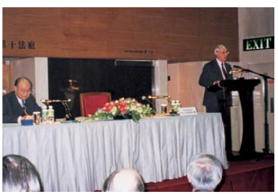
苗禮治勳爵發表演説 Lecture by Lord Millett