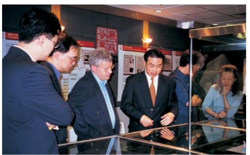
參觀廉政公署 Visit to ICAC