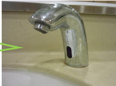
Sensor Water Tap