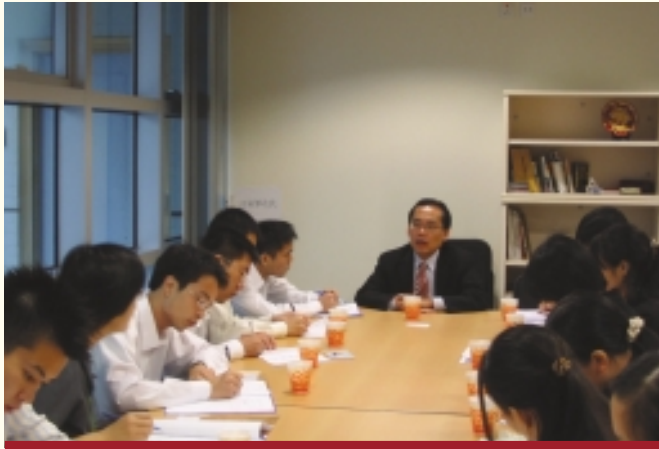
總裁判官向汕頭大學的學生介紹裁判法院的工作 The Chief Magistrate briefs students of Shantou University on the work of Magistrates' Courts