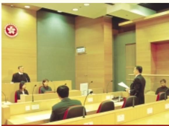
在裁判法院進行的聆訊 A court hearing at Magistrates' Courts