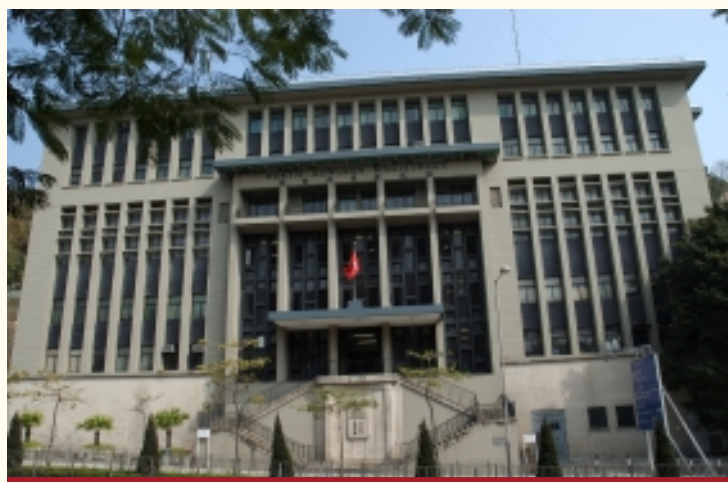
北九龍裁判法院 North Kowloon Magistrates' Courts

All criminal prosecutions must commence in the Magistrates' Courts. The Secretary for Justice may transfer cases to the District Court or the Court of First Instance depending on the seriousness of the offence.