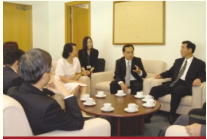
總裁判官與福建省高級人民法院代表團會面 The Chief Magistrate meets with a delegation from the People's High Court of Fujian Province