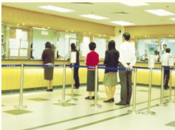
裁判法院登記處 Registry of Magistrates' Courts

為了向法庭使用者提供更佳服務及縮短市民在裁判法院繳交罰款所需的輪候時間，我們已於九龍城裁判法院、沙田裁判法院、荃灣裁判法院及粉嶺裁判法院推行「創新聯網技術」試驗計劃，將以上各裁判法院會計部的電腦與其所屬裁判法院各法庭的電腦聯線。透過這個方法，會計部便可即時在線上取得有關法庭所判處罰款的數額，並能同步安排市民繳付罰款。該項計劃已證明可行，並將於 2005 年推廣至其他裁判法院。